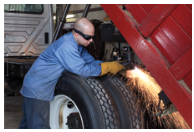
Vehicle repair and modification